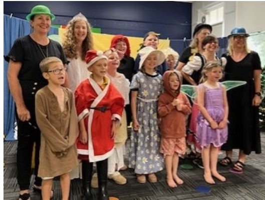
The Cast of 'The Real Story of Jack and the Beanstalk'