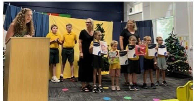
K-2 Class Award Winners