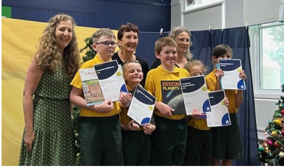
3-6 Class Award Winners