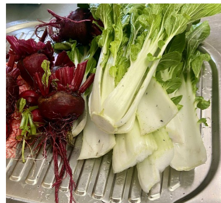
The students loving growing our very own vegetables. Here is a photo of today's pickings.